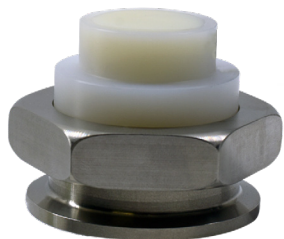
H6 KF-40 Sensor Housing