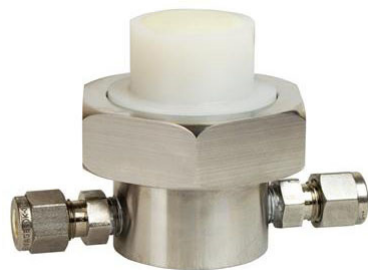
H3 Flow Through Sensor Housing